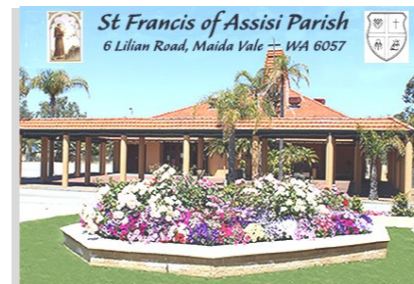
St Francis of Assisi Parish 6 Lilian Road, Maida Vale WA 6057